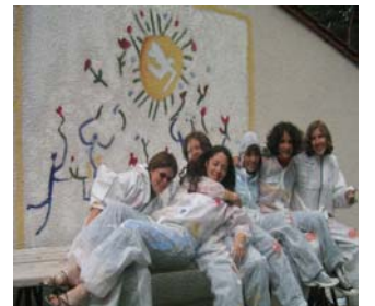
Social services activities during WYD 2005